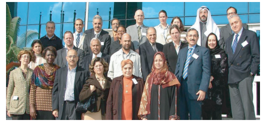
PulseNet Middle East Meeting Attendees

The first day began with presentations from staff of the CDC and APHL on foodborne infection surveillance in the USA. They described the PulseNet program and its role in foodborne disease surveillance in the USA. From a global perspective, both the PulseNet International and the WHO-Global Salm Surv (GSS) program were introduced to participants, which share the goal of strengthening foodborne disease surveillance in countries around the world. The second half of the day consisted of presentations by laboratory staff